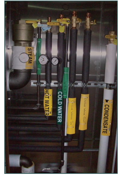
Internal insulated labels