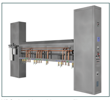
UDS plumbing with water filter

Burying utilities in walls, ceilings and floors is expensive and makes remodeling costs soar. Caddy Utility Distribution Systems provide a single power center for gas, electricity, water and steam. Only one connection is needed for each utility. A UDS can save more than 20% in construction costs and even more when remodeling. Caddy can provide UDS's as a wall mount, island, and ceiling configurations. We also offer power poles that are perfect for prep areas.