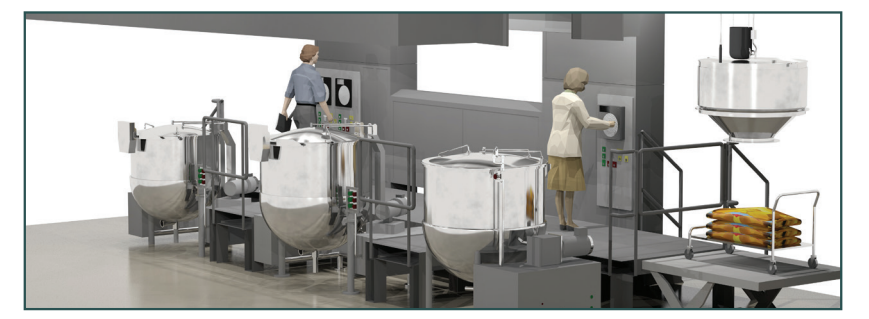
Cook Chill UDS System