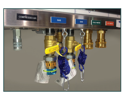
Labeled quick disconnects