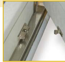
Open Door Retainer