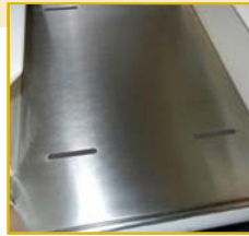
Stainless Screened Drains