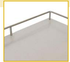
Top Mount Rail