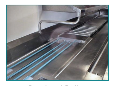
Band and Roller Conveyor